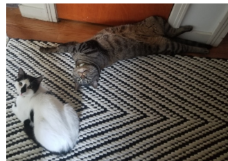
Valentino (left) with buddy

Adoptions: We have special cats at our shelter who enjoy their free roaming home but would also welcome sharing their own home with you. Some are senior cats; some are timid; some have quirky personalities ... not the usual lap cats, perhaps. If you are interested in meeting them, please contact Karen at (716) 352-0439. Hope for Cats can waive their adoption donations and provide you with generous amounts of the food which they have been eating.