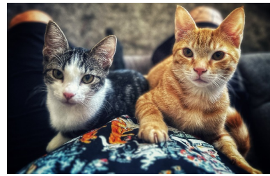
Alley Cat (left) with his brother

Socks, Marvin, and Alley Cat: These 3 kittens were found outdoors on the West Side of Buffalo, by a volunteer's co-worker. They each have found new homes, thanks to the efforts of their rescuer and our volunteer.