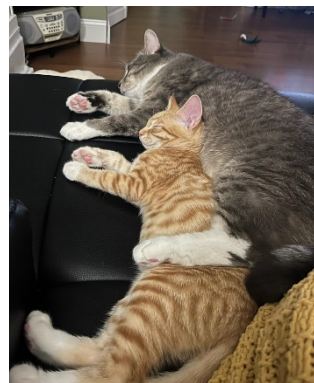
Orange tabby Socks with his new brother

Sinatra & Valentino: These young cats were found as strays on the East Side of Buffalo. Here is Sinatra (all white with blue eyes) relaxing in his new home; and Valentino (rescued on Valentine's Day) sharing his new home with his tabby cat brother.