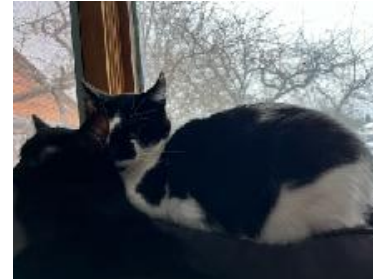
Boop and Friend