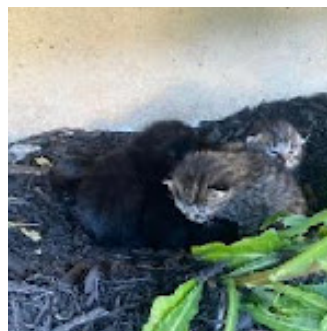
Kittens huddled in a bowl crafted by Mom awaiting her return.